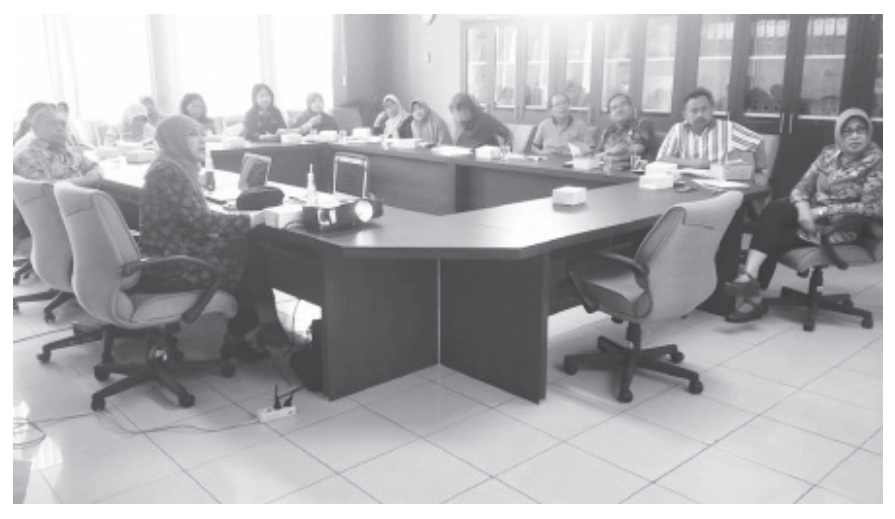
Figure 8. Advocation at Health Office of Bogor District