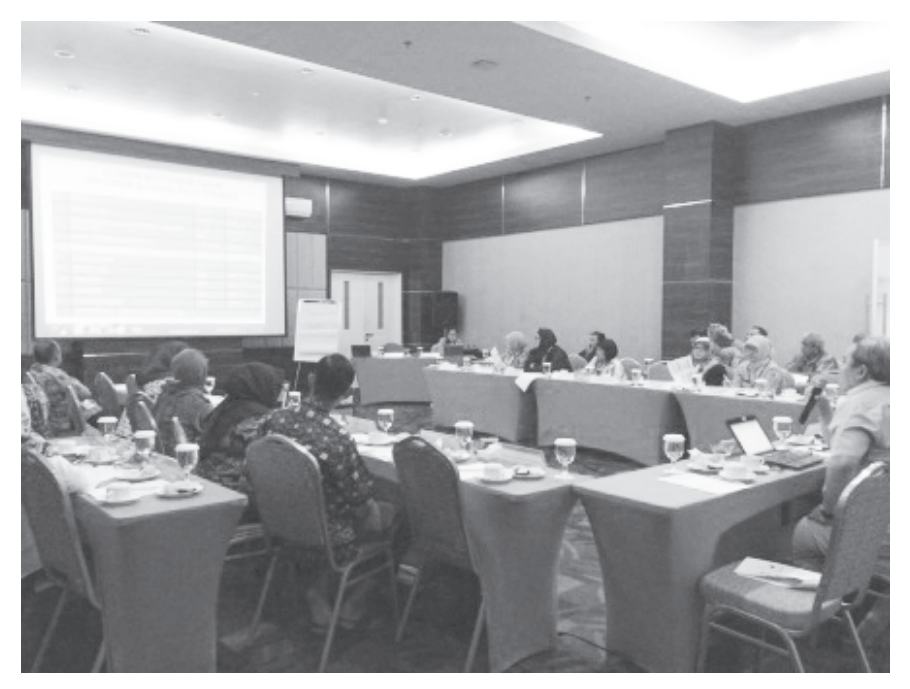
Figure 6. Focus Group Discussion