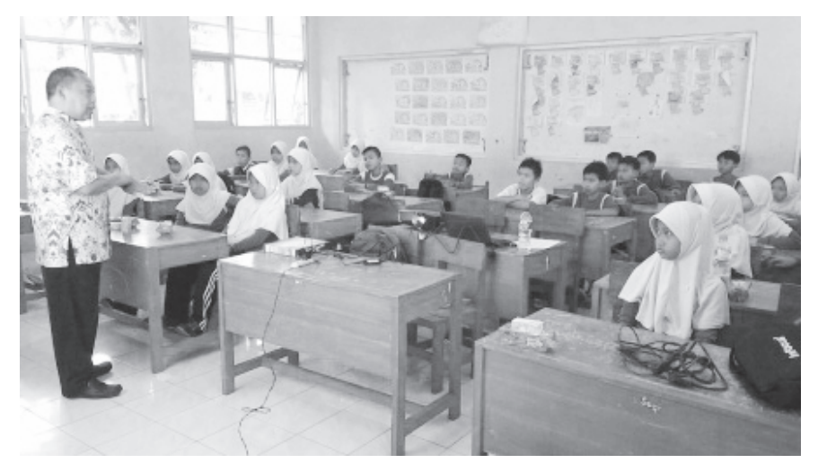
Figure 4. Nutrition education