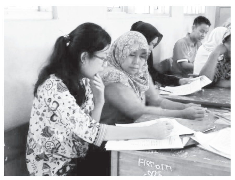
Figure 2. Interviewing the mothers of school children