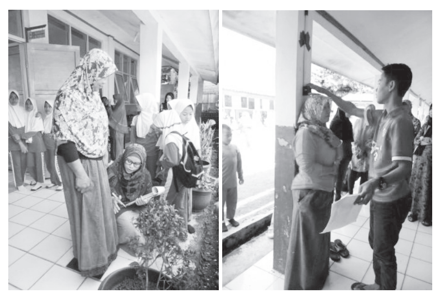
Figure 3. Anthropometry measurement