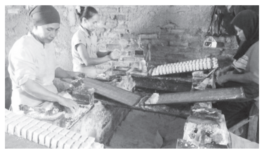
Figure 5. Iodized salt factories visitation